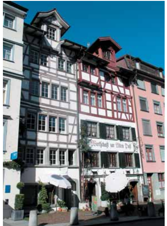
The gorgeous old town of St.Gallen

Around St.Gallen and its neighbouring canton of Appenzell, you can visit the beautiful rolling hills, the magnificent Lake Constance and the panoramic vistas of the Alpstein mountains. Or take a days outing to Liechtenstein to see its charming villages and castle. This September, why not simply walk through the «Indian summer coloured» parks and forests surrounding the renowned University of St.Gallen, which will be hosting the World Ageing & Generations Congress 2007 .