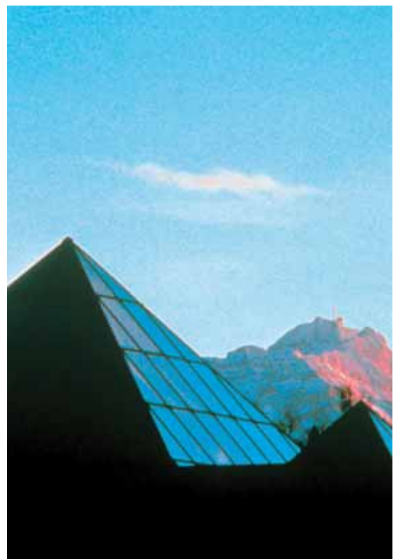
The panoramic view from the University of St.Gallen of the Alpstein mountains