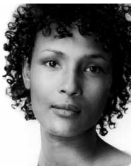
Waris Dirie, Award Winner

Waris Dirie is the founder of the Waris Dirie Foundation (2002) whose aim is to call attention to the inhumane treatment of uncounted girls and women around the world. Waris Dirie collects money and support for her campaign against female genital mutilation. Because of this involvement, in 1997 she was appointed by Secretary General Kofi Annan as Special UN Ambassador against female mutilation. Through her books, she has successfully brought this sensitive and tabooed topic into the public conscience. Today, Waris Dirie lives in Vienna and continues her fight for the rights of women all over the world as an Austrian citizen.