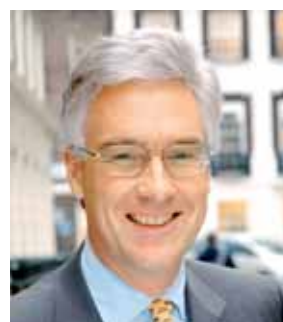
Lord Adair Turner