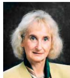
Baroness Sally Greengross