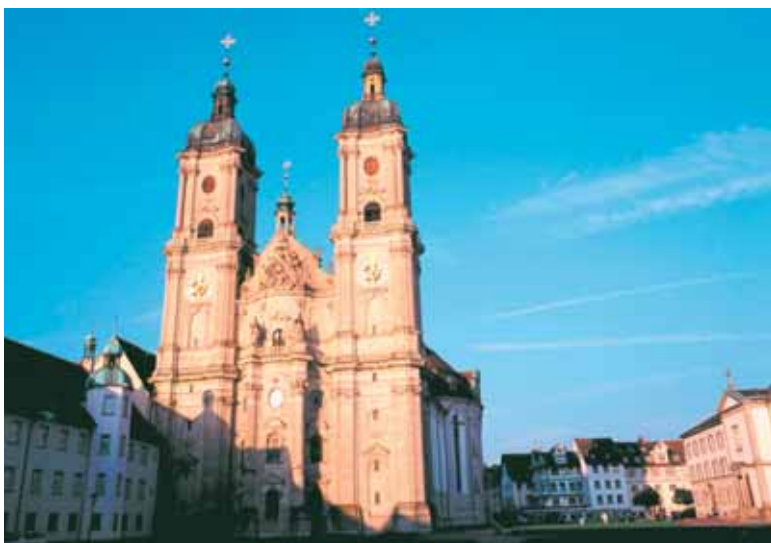
The magnificent baroque cathedral founded in the 7th century